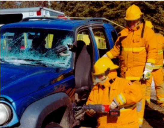
Candle Lake Emergency Services training on the use of vehicle extrication tools