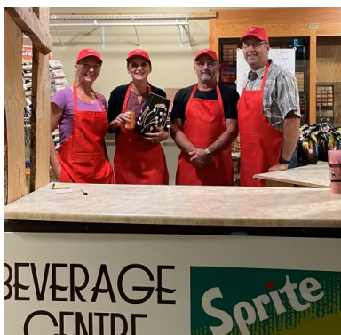
Candle Lake Chamber of Commerce volunteers provided a concession offering soft drinks and snacks including buttered popcorn.

We'd love to hear what you think of The WAVE. If you have any comments or questions, please contact us at info@candlelake.ca