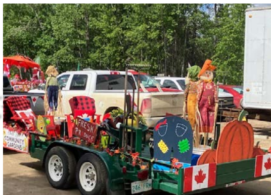
Community Gardens float in the Canada Day Parade

The Board wishes to acknowledge the assistance that was provided by numerous community volunteers to facilitate these activities and events.