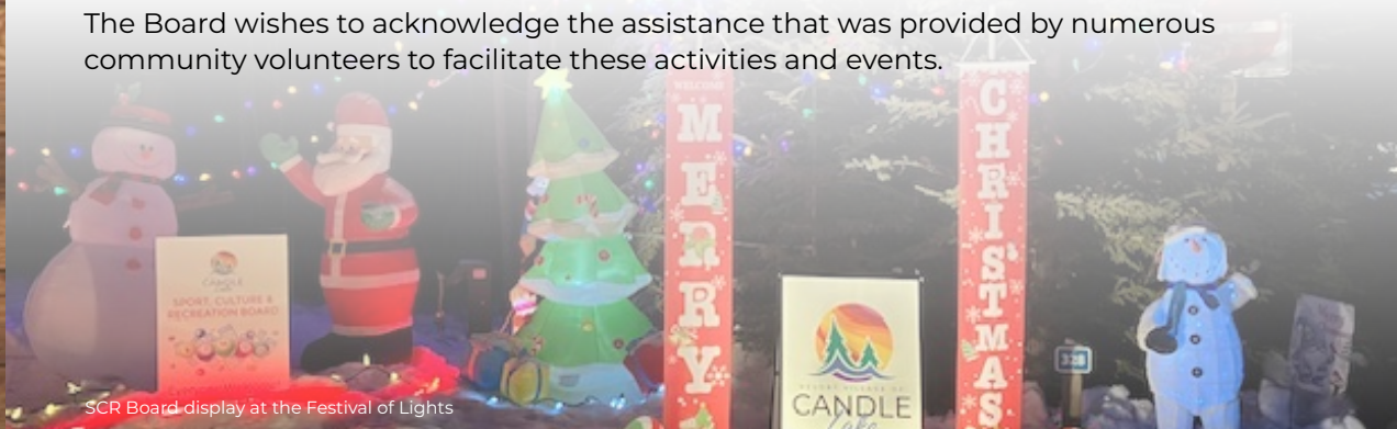
SCR Board display at the Festival of Lights

The Board wishes to acknowledge the assistance that was provided by numerous community volunteers to facilitate these activities and events.