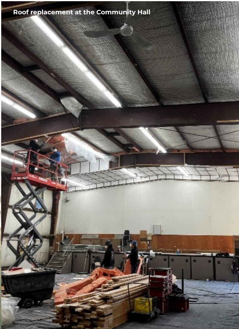
Roof replacement at the Community Hall

Streetside yard refuse will be picked up along with your household garbage following each of the long weekends in May, August and September. Yard refuse including leaves, grass clippings, garden waste must be bagged in clear bags under 10kg(22lbs). Tree limbs under 4' in length must be bundled and tied under 10kg(22lbs).