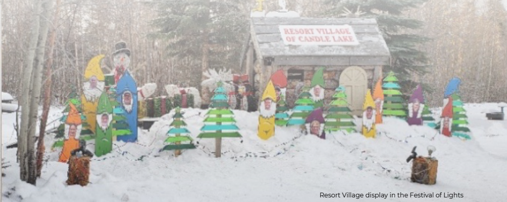
Resort Village display in the Festival of Lights