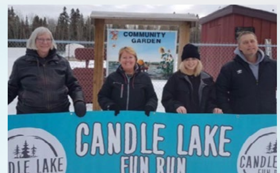
The Candle Lake Fun Run is just one group that has supported our community garden!