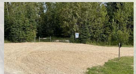
Trailhead upgrades at Tapawingo