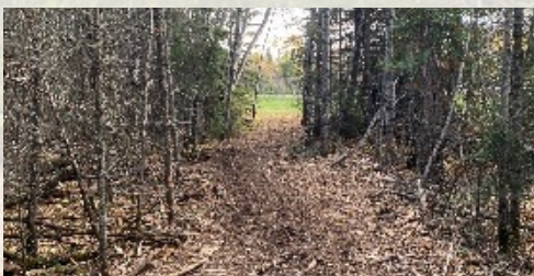
Fun Run Trail during construction