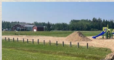
Improvements being made to Memorial Park in July