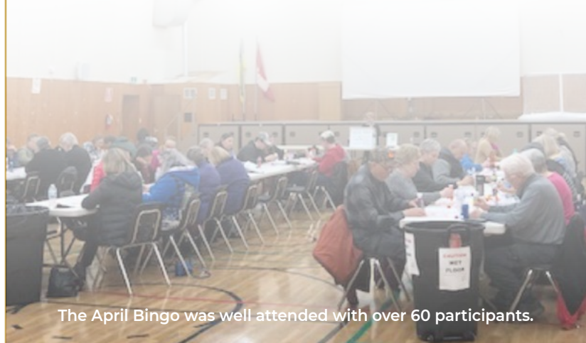
The April Bingo was well attended with over 60 participants.