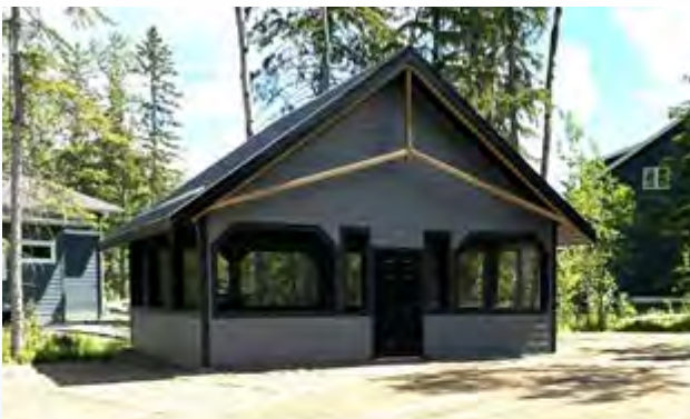
New Harbour Golf Estates Picnic Shelter