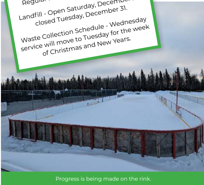
Progress is being made on the rink.

Waste Collection Schedule - Wednesday service will move to Tuesday for the week of Christmas and New Years.