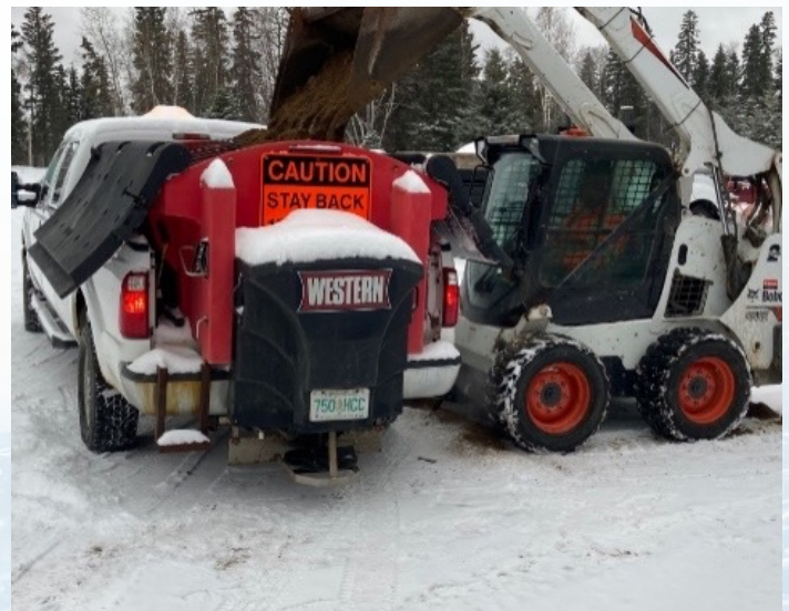
Candle lake village plow truck warming up for the first snowfall of the season.